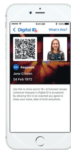
Digital Keypass Digital NSW & SA Driver Licence