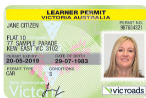
Victorian Learner Permit