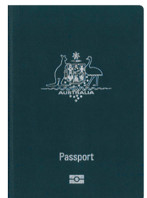
Australian or Foreign Passport