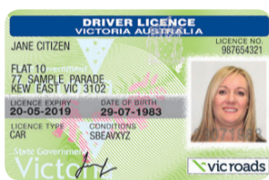
Australian Driver Licence